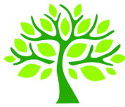
The Elms School, Dover