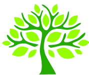
The Elms School, Dover