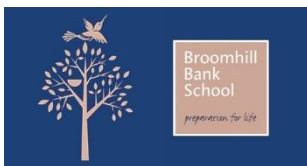
Broomhill Bank School, Tunbridge Wells