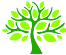
The Elms School, Dover