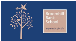
Broomhill Bank School, Tunbridge Wells