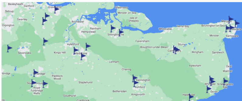
A map of our schools across the county.

KsENT stands for Kent Special Education Needs Trust. It is a Cooperative Foundation Trust of 26 schools across Kent with the aim of improving opportunities for children and young people with SEND. As of June 2025, all of our member schools have been graded either “Good” or “Outstanding” following their most recent Ofsted inspection.